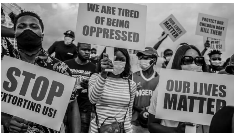
Nigerians protesting