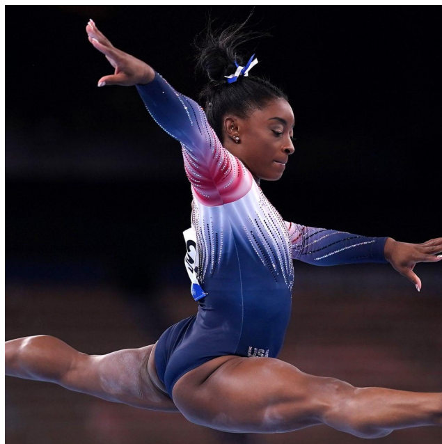
Simone Biles, award winning athlete

Was the year 2021 as terrible as it was great? The answer may very well be subjective. Wherever you may stand on the divide, it is already apparent that 2022 will be just as eventful. Could it be the year the spread of the COVID-19 virus would be put under some form of control? Not likely.